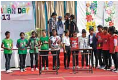
Breaking out of the mould...music with just about anything