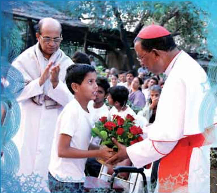
A Balbhavan child welcomes Cardinal Toppo with a bouquet of flowers