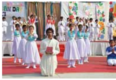
It all starts with God