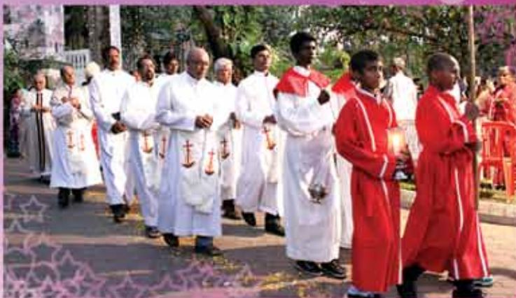
The entrance procession