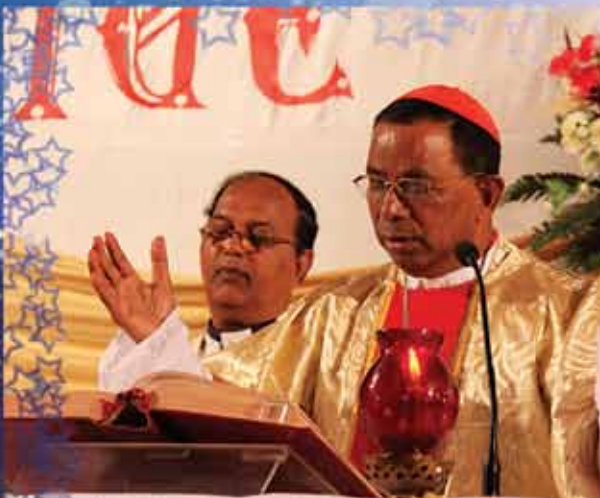
Cardinal at the Altar