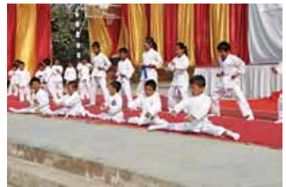
War cries fill the air...the little ones do the Karate routine