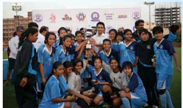
The winners trophy for the Indian women's football team played against Netherland