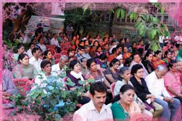
The faithful attending in the Eucharist