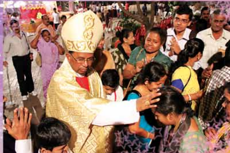
Cardinal blesses the devotees