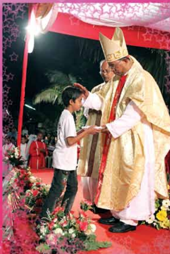
A child at the offertory procession