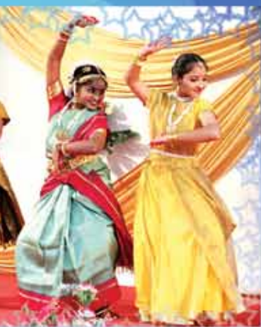
A prayer dance performed by Agnel Technical Complex children (Vashi)