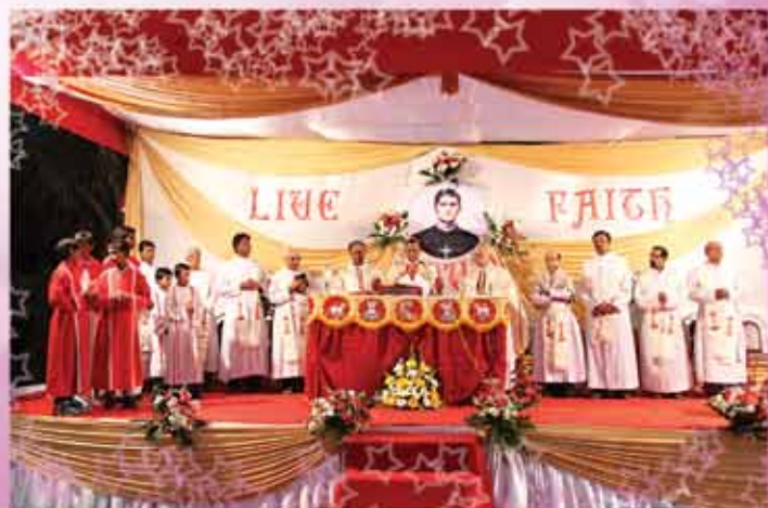
Cardinal Toppo celebrates Eucharist along with the Concelebrants