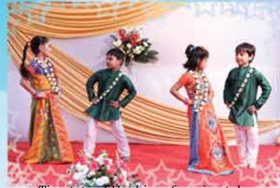
Tiny-tots of Vashi perform in style