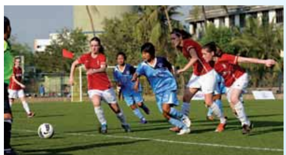
India vs Netherland football