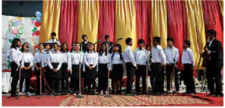
A melodious expression of love...The Balbhavan Choir