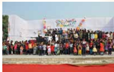
From strength to strength they grow every year!