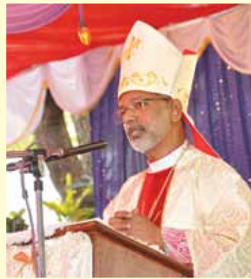
A Message from Bp. Savio