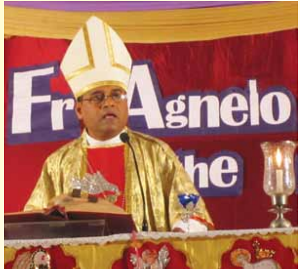
The Bishop Delivers Homily