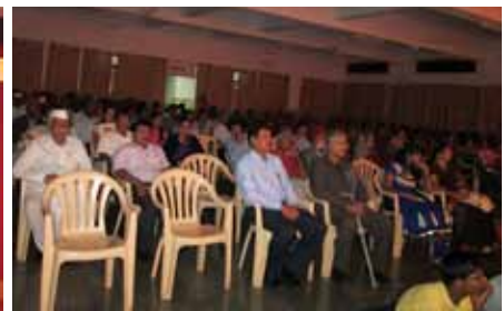
The audience witnessing the programme in Fr. Agnel Vidyankur School hall