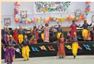
Radhas & Krishnas dance to the beat of love