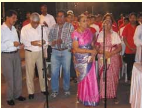
The Choir of Marathi Speaking Community