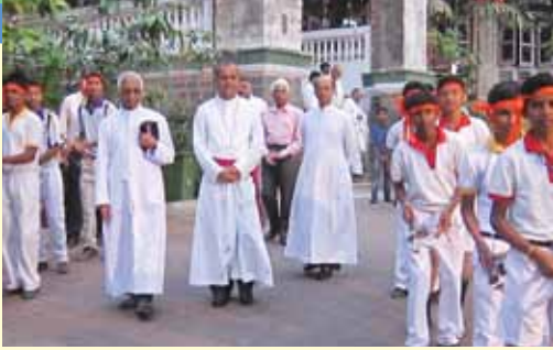
The Ashram Fathers and Balbhavan Children