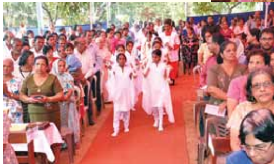
Our Children perform a Prayer Dance