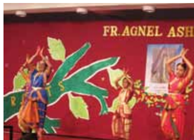
The Kalanjali Bharatanatyam group performing a Dance