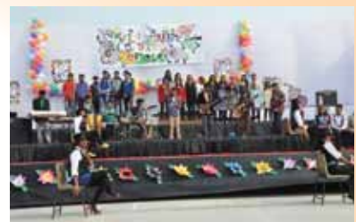
A Music & dance Course by the Balbhawan Kids