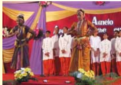
A Prayer Dance by Fr. Agnel Multipurpose School (Vashi)