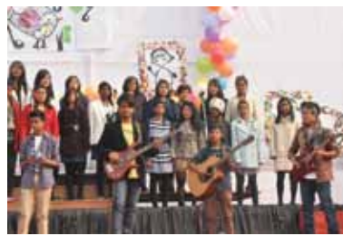
The Balbhawan choir – celebrities in-the-making