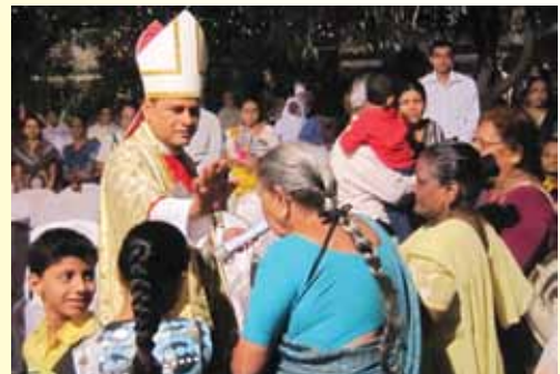
Bishop Elias blesses devotees