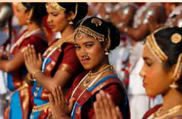
Native Dancers doing a Prayer Dance