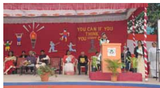
The School Sports' Minister Takes an Oath