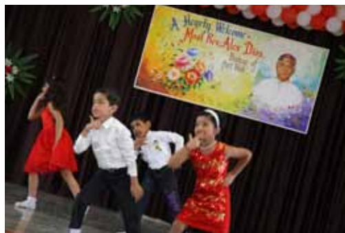
The Pre-Primary Angels Danced "A Way To Glory"