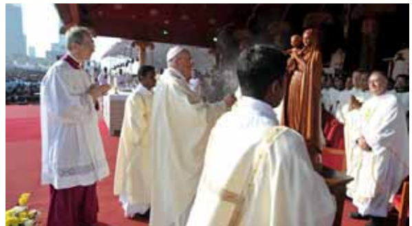
Pope Francis during the Canonization Ceremony