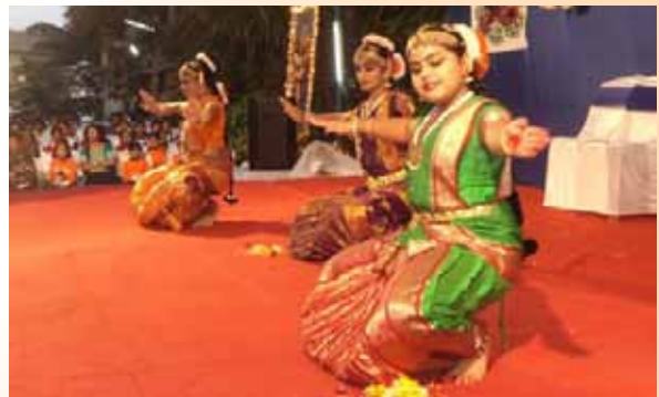
Dance by Budding Artists of Agnel's School, Vashi