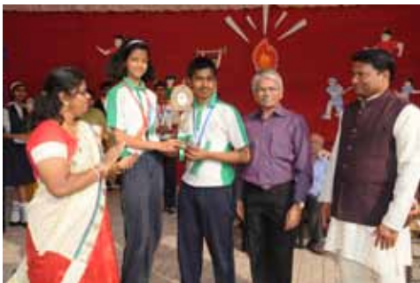
Our Chief Guest Distributes Trophies to the Winners