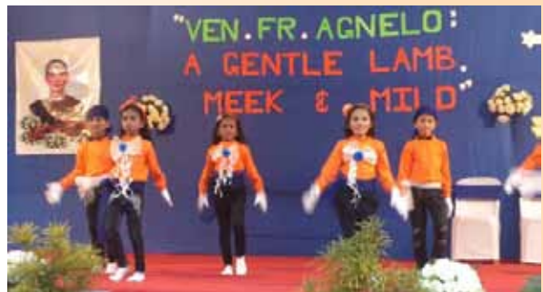
A Dance by Tiny Tots of Agnel Primary School