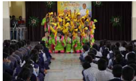
The Traditional Bhangra Dance - An All Time Favourite