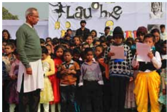
The Students give a Vote of Thanks