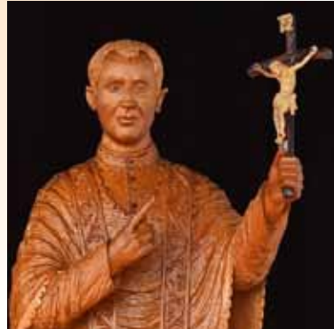
St. Joseph Vaz-Sri Lanka's First Saint