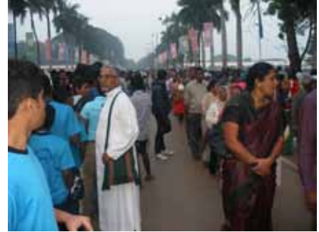
At Old Goa