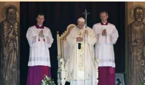
During the Canonization