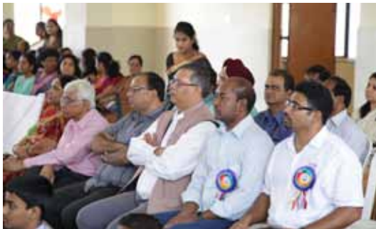
Some Dignitaries who graced the Occasion