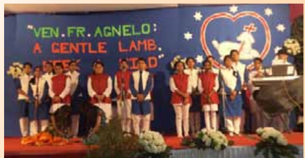
Vashi Agnelites proclaim in song Freedom for a Girl Child