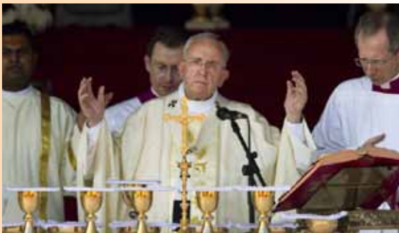
Pope Francis Celebrates the Eucharist