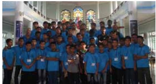
At Pilar Seminary