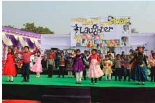
Happy Kids Rock & Dance