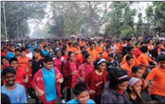
The Participants of the Agnel Minithon