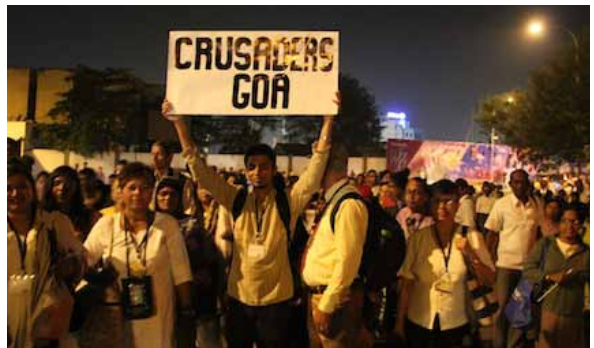
A large contingent of Goans attending the Canonization