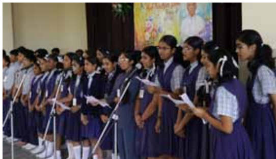
The Agnelites Choir captivated the select Audience