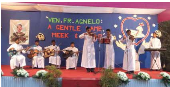
Instrumental Rendition of Char Kadam by the Scholastics