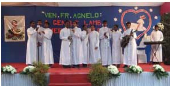
I Dreamed A Dream by Scholastic Bros