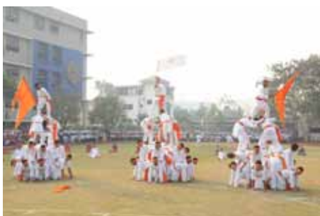
Performing Lezim Pyramid