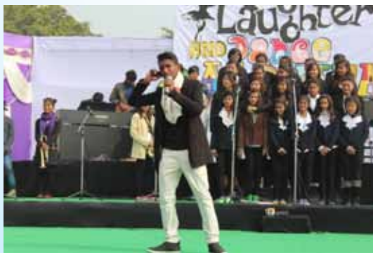
Entertainment by A Phone Call