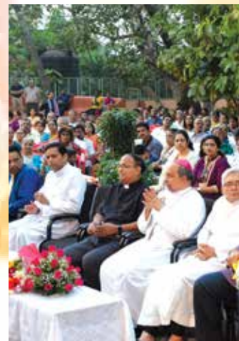
Audience watches t