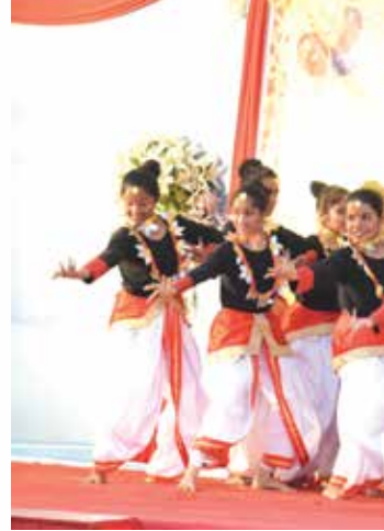
A Prayer Dance by