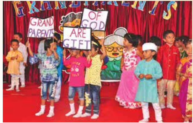
Grandparents are a blessing -LKG Periwinkle