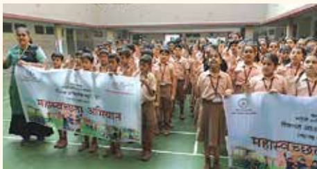
Students at the Swachh Bharat Rally