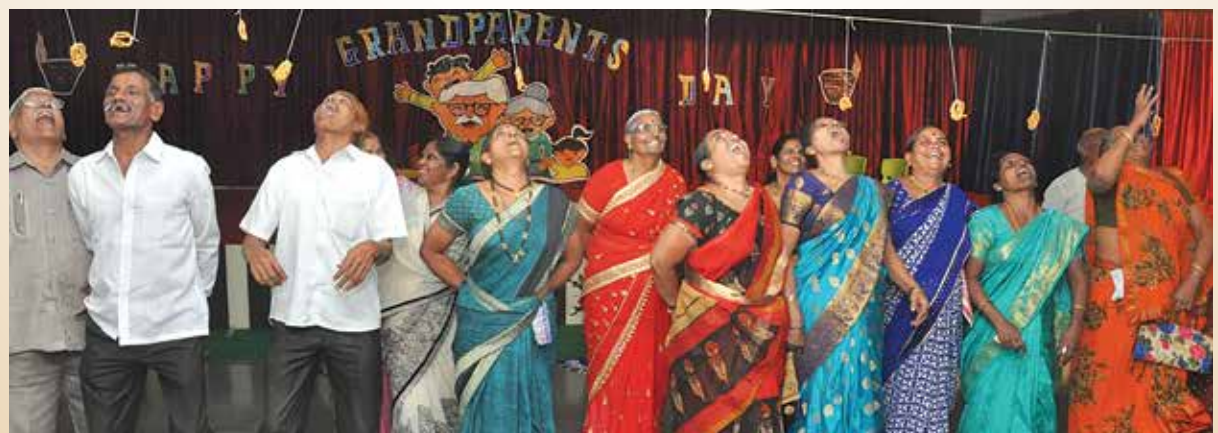
An activity of fun for the Grandparents