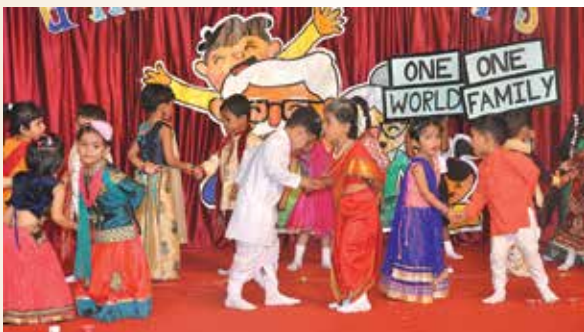
Giving the message of one world, one family - Nursery Periwinkle