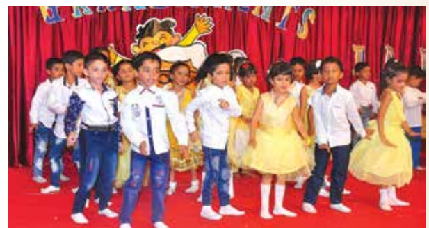
A dance performed on Grandparents day - UKG Tulip