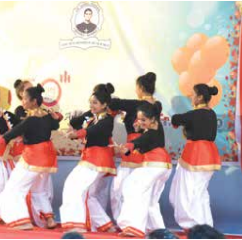
the students of Fr. Agnel, Vashi