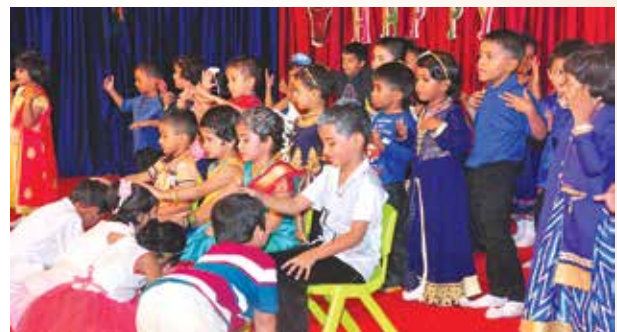
Playing the role of Grandparents-LKG Rose