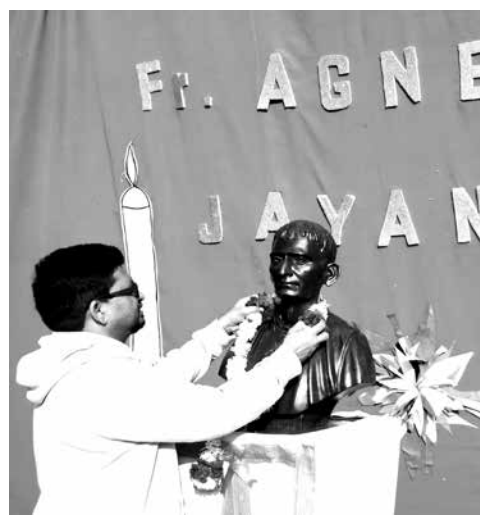
Garlanded The Bust By Our Director