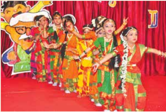
Welcome dance for Grandparents - UKG