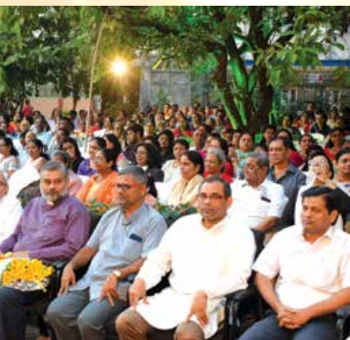
the programme with rapt attention