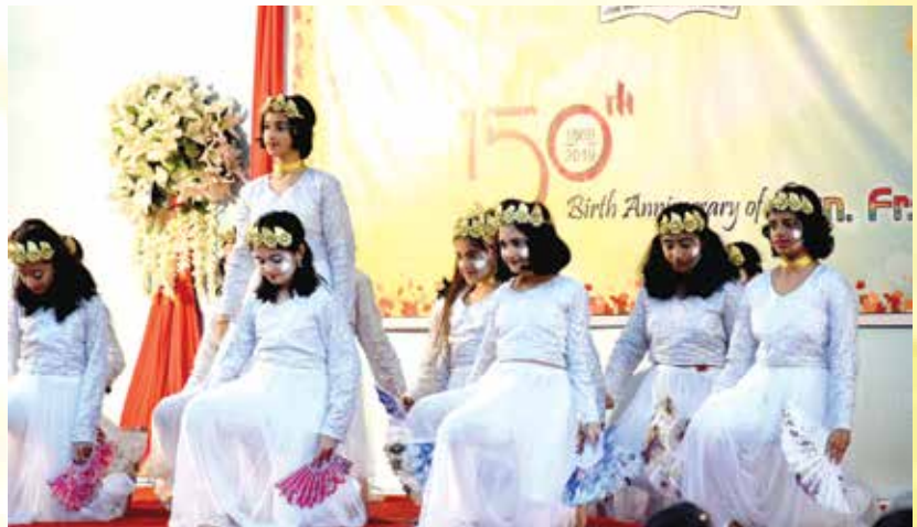
Dance by Budding Artists of Agnel's School, Vashi