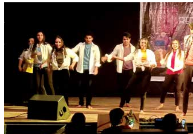
Students performing dance