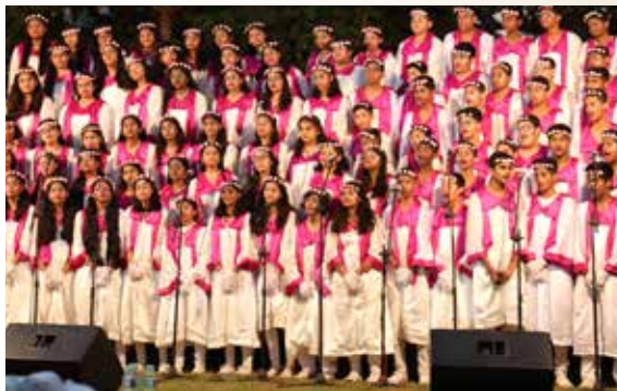
The Melodious Choir