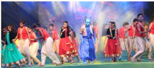
Magic happens... when you believe