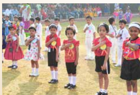
Oath ceremony of the tiny tots.