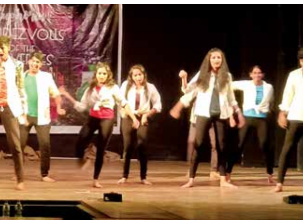
Dance performance at Yashwant Natya Mandir