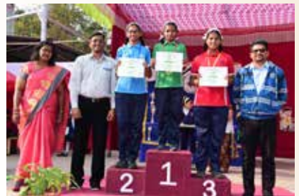
The winning stars.