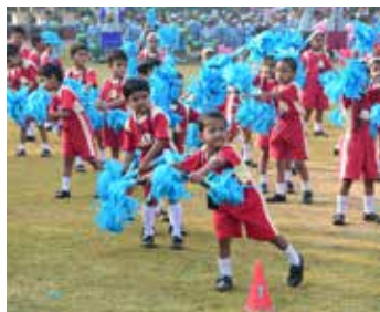
A Ponypom drill by Lkg.