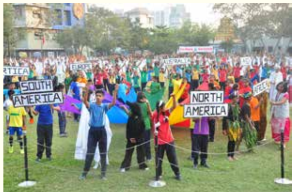
Finale-one world one family.