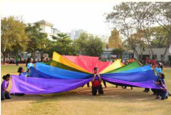
Colours of Life By Std-VI.

of different colours and continents , tribal dances such as Thakars , Santhals and Gonds , importance of suryanamaskar, zumba and praying for world peace through the performance of Shanti Mantra. The Chief Guest gave an inspiring speech and also appreciated the hard work of the teachers and students. The program concluded with the theme song "ONE WORLD ONE FAMILY". ■