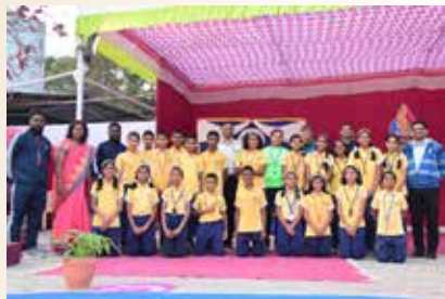
Runner-up champions of the year.