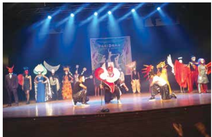
Fashion show at St. Andrews Auditorium