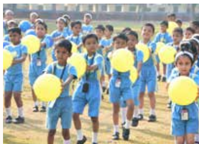
Ball drill by UKG.