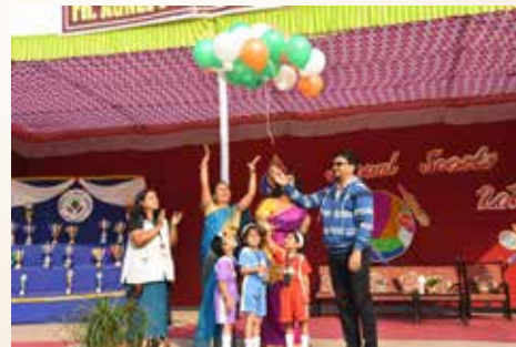
Releasing the balloons