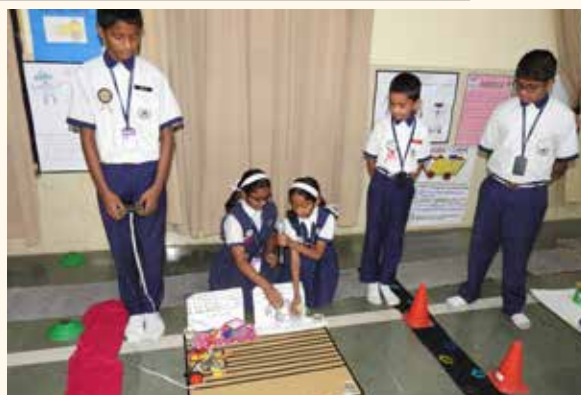
First Prize- Working Model of Vegetable Sorter By Std V Tulip.