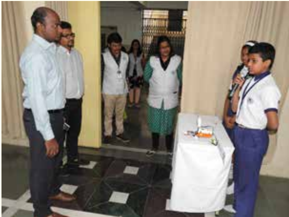
Students explaining the touch sensor during the inauguration ceremony of robotic competition.

This competition helped students to understand the importance of team work and use of modern technology for a better future. ■