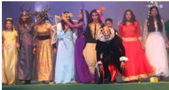
Goodness crowned, evil defeated

Wishing our Dear Benefactors a Happy & Holy Easter.