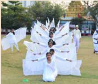
Peace makers by Std Ninth.