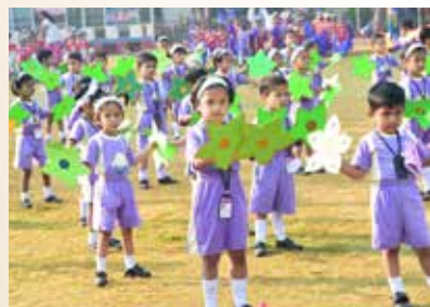
A flower drill by nursery.