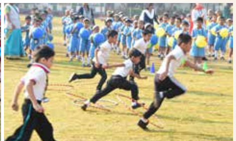
Hurdle race by UKG boys.