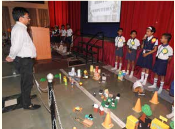
The Director appreciating our creative genius of Std IV periwinkle.