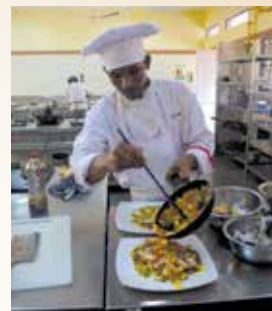
Final presentation of dish by participant.