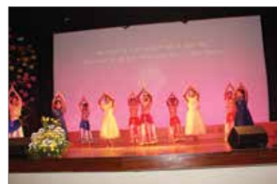
Welcome Dance by Balbhawan Children