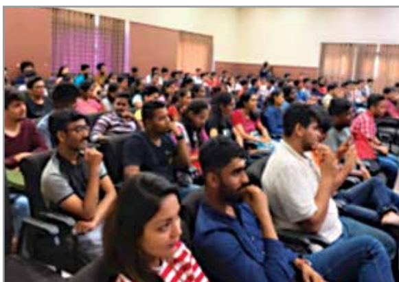
The audience are all ears!