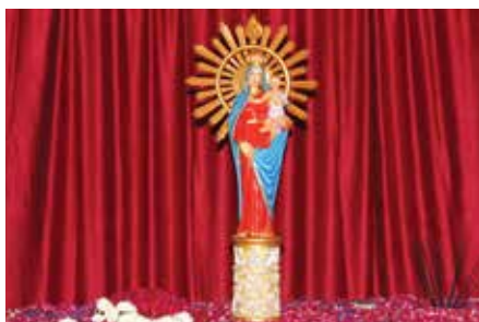
Our Lady of Pilar