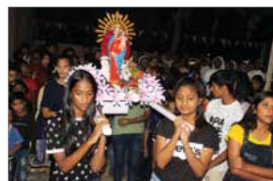
"Palki" of Our Lady of Pilar Statue