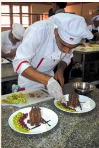
Participant at Gastronomix.