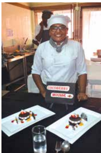
Participant with one of the award winning bakery product.