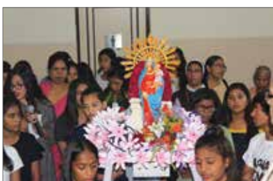
Devotees worshipping Our Lady of Pilar Statue