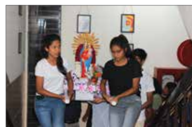
Balbhawan Children carry the Statue of Our lady of Pilar