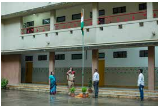
A Salute to the Tricolour