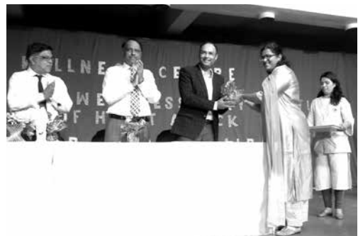
Felicitating the Guests.