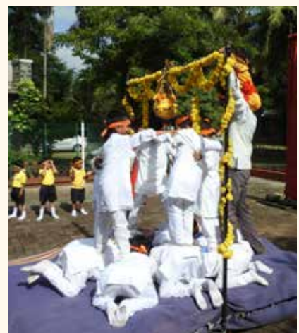
The Pyramid to reach the Handi.