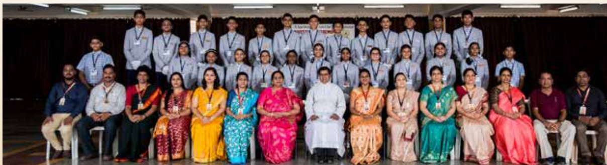
The blessings of our mentors leads us on