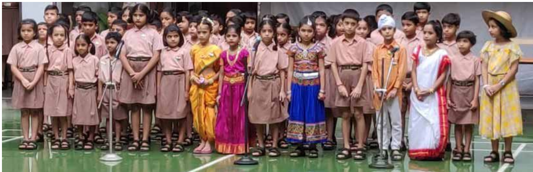
Hum Bharatwasi - primary children