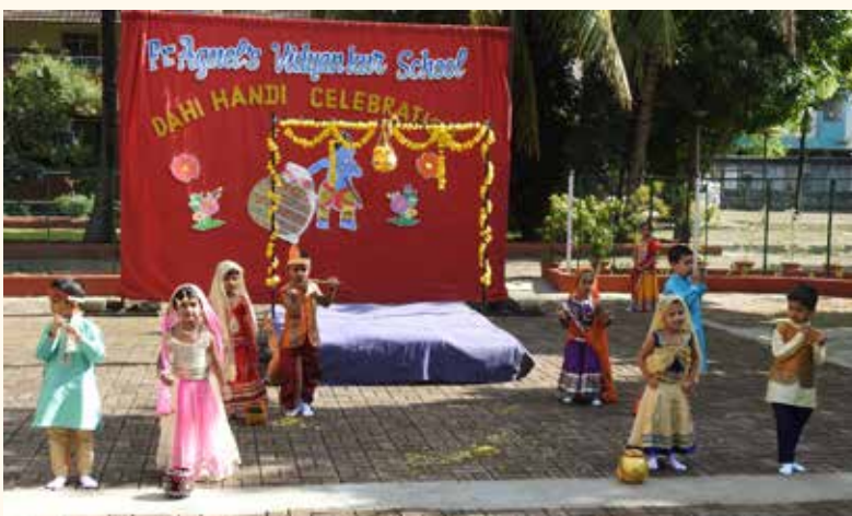
Musical Skit performed by Pre-Primary.