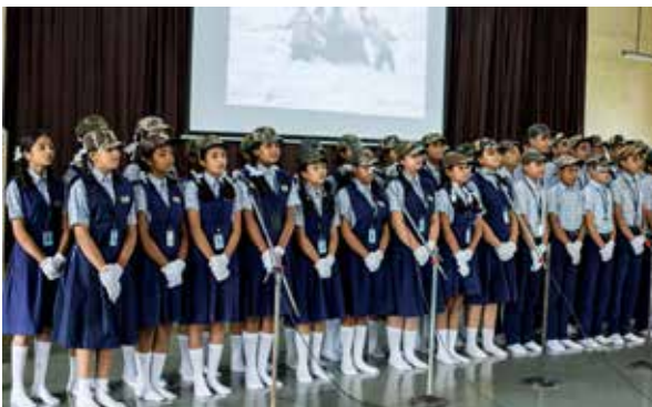
A soulful Melody in Honour of our Motherland