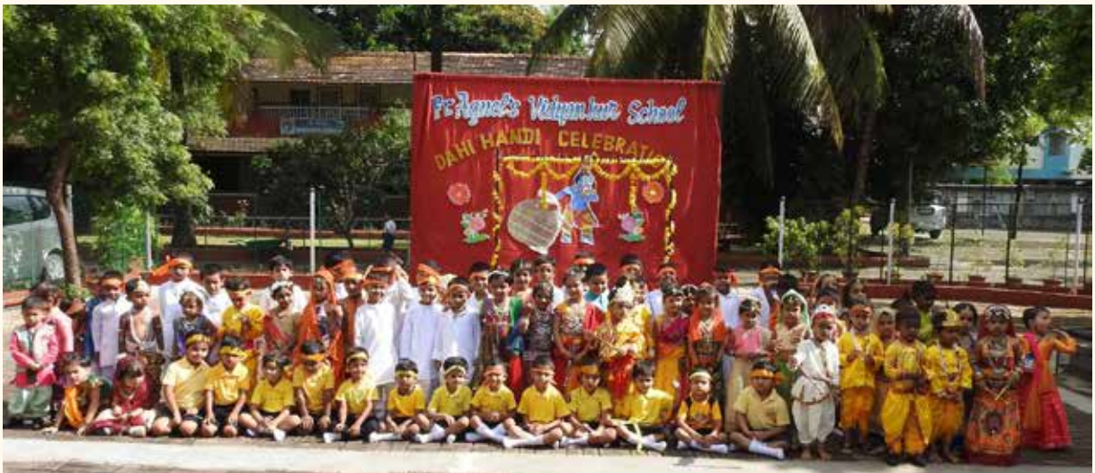
Our Little Kanhas

All the students enjoyed dancing and singing together on the melodious tunes of Hindi songs. The efforts of the little ones making the pyramid to reach the handi was wonderful to witness and was appreciated. The celebration continued to stir excitement and enthusiasm in the minds of the children even after the vote of Thanks.