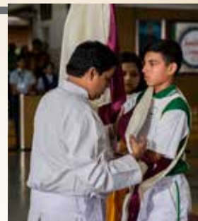
Investing the mantle of responsibility