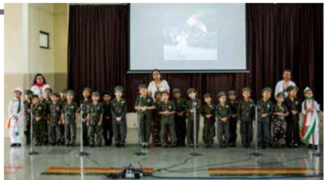
Our Little Jawans sing a Patriotic Message