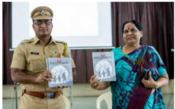
The Agnel Prism Sparkles Anew