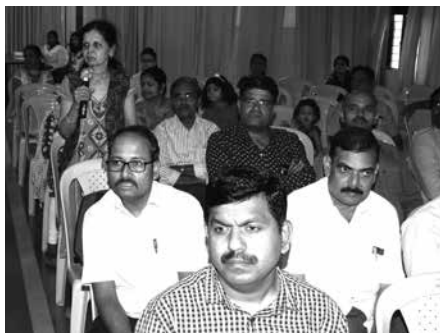
An interactive session with audience.