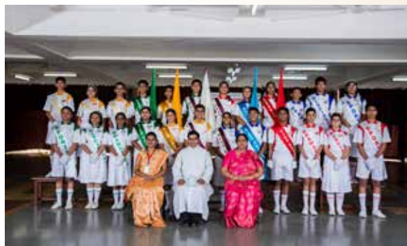
The pillars of Agnels