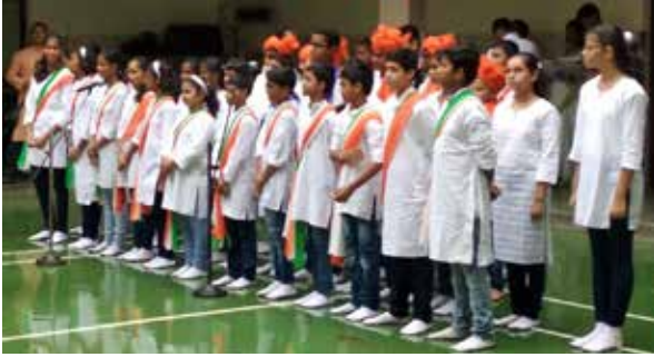
Patriotic song by Middle school students.