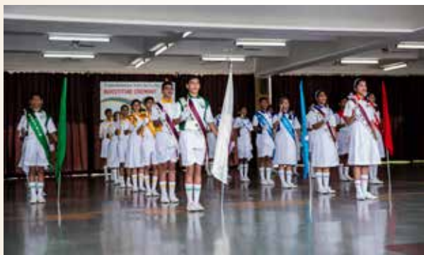
Service before duty