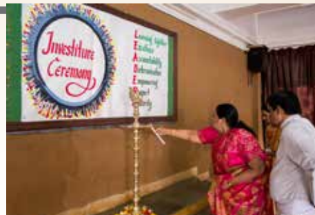
Enlighten our path, O Lord