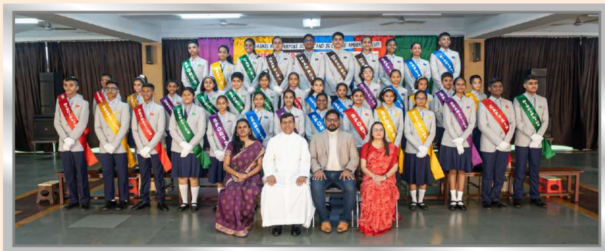
The school management with the newly elected Student Council.