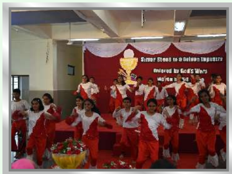
A cultural program by the students.