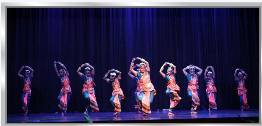
A cultural performance being staged at Model United Nations (MUN) 2025 conference.