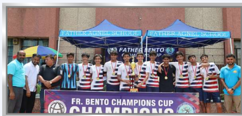
Somerville School, Greater Noida, the winner of the Fr. Bento Cup, in the U-18 Boys category.