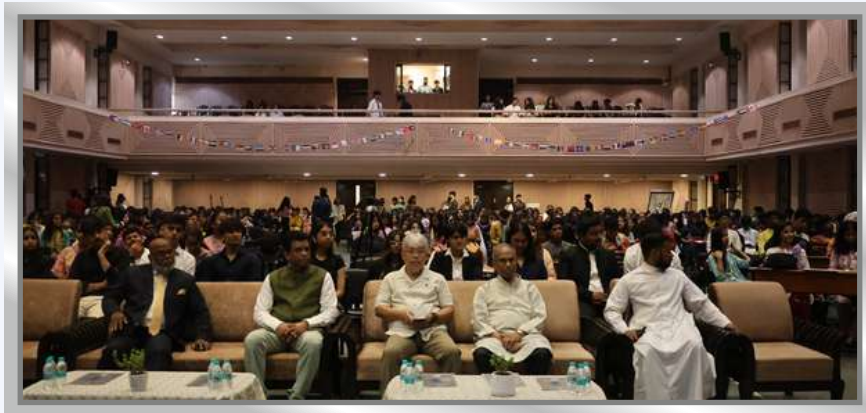
Dignitaries at the Model United Nations (MUN) 2025 conference.

VERUS MUN was more than a conference - it was a journey of growth, learning, and unforgettable memories, instilling in the learners a sense of purpose to make a difference.