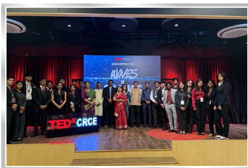
The organising team, speakers and guests at the TEDxCRCE Annual Conference 2026.