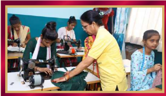
Empowering women through training in tailoring